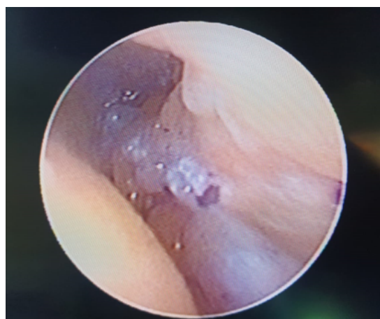
Fig. 2: Endoscopic view of cut TCL.