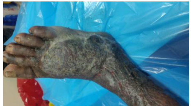
Fig. 5: Maceration of skin post scar management