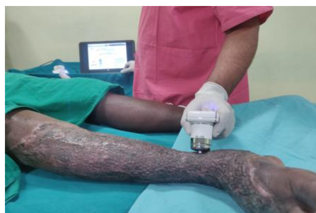
Fig. 1: Videodermoscopy assessment of scar

There are a many tools available for scar assessment. The most important features which should be assessed are: colour, vascularity, light reflection, texture, contour, pliability, height, distortion, relation to the relaxed skin tension lines (RSTL) relation with important landmarks in the area of the body. Vancouver scar scale before starting scar management -10 .Video dermatoscopy done to assess the scar.(Figures 1 and 2)