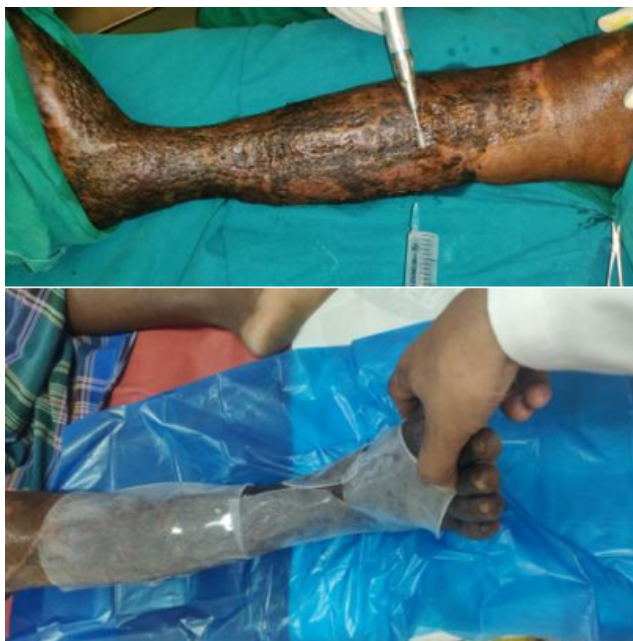
Fig. 3: Microdermabrasion