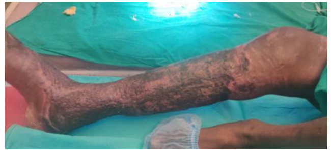
Fig. 11: After scar management

The scar was managed with coconut oil massage, microdermabrasion, silicone sheet application, compression garment.(Figures 3, 4 and 5) Maceration of skin noted for which hydrojet debridement, silver wash and cream application done(Figure 6).Topical onion extract application was done for scar(Figures 7 and 8). He undergone LLLT and high level laser therapy for scar management (Figures 8 and 9).At time of discharge score 7/13.(Figure 10)