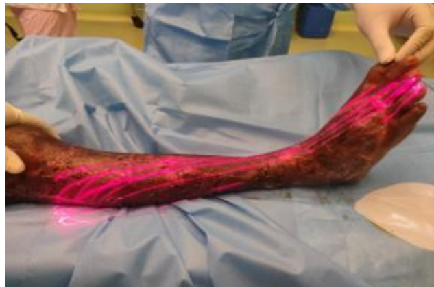
Fig. 9: Low level laser