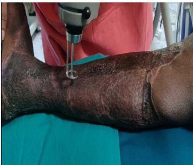
Fig. 10: High level laser