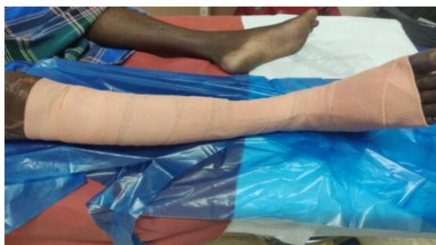
Fig. 4: Compression garment