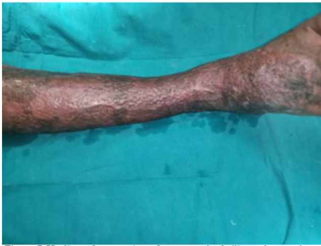
Fig. 8: Healing of maceration after removal of silicon sheet and compression garments. Application of Silver ointment and antibiotics