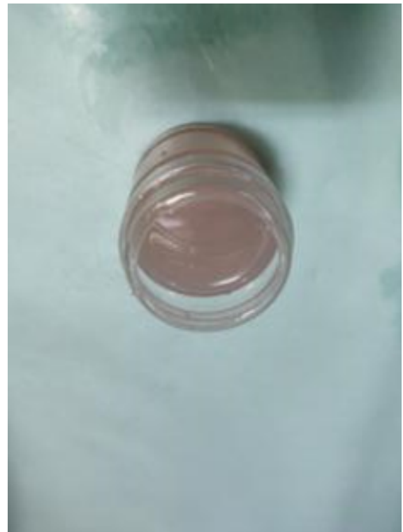
Fig. 6: Onion extract