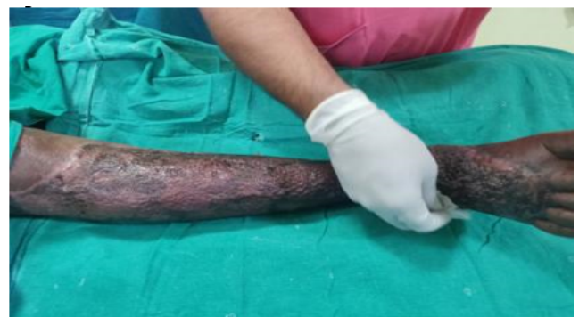
Fig. 7: Topical application of onion extract