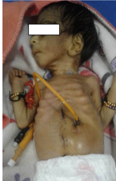
Fig. 3: Showing follow up photograph of baby having feeding gastrostomy tube and cervical oesophagostomy.