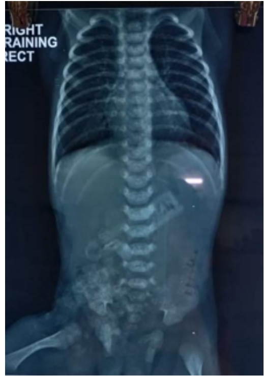
Fig. 2: X-ray showed gasless abdomen indicating isolated oesophageal atresia and one additional floating rib left side.

Sham feeding was started on post-operative day two. Feeding through gastrostomy tube was started on seventh post-operative day. Baby tolerated feed through gastrostomy