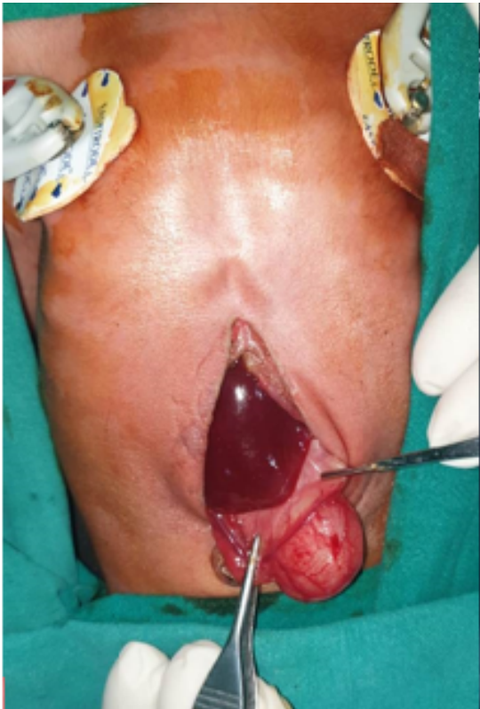
Fig. 1: Showed duplication cyst along the greater curvature.

atresia with pyloric atresia. USG abdomen showed two heterogeneous cystic structures with thick walls (3.8x3.0 cm and 1.7x1.6 cm) were noted at left hypochondriac region. These lesions were abutting and compressing the stomach. Spleen and kidney were seen separately and normal. These findings were concluded foregut duplication or extra lobar pulmonary sequestration. After getting routine blood reports baby was taken for surgery on live day second. Baby was operated under general anaesthesia with endotracheal intubation in supine position and bolster beneath the both shoulders to make slight extension of neck. After painting and draping, mid line upper abdominal incision was given. Stomach was delivered through wound. There was a palpable cystic swelling at middle of greater curvature of stomach (Figure 1). This cystic swelling was excised and stomach was repaired and feeding gastrostomy done. Cyst was not communicating with stomach cavity. Abdominal wall repaired and feeding gastrostomy tube was fixed from abdominal wall. Left cervical esophagostomy was made to drain out the saliva from oral cavity. Excised cystic swelling was sent for histopathological examination. Histopathology of specimen was showing gastric mucosa with muscle layers, which proposed the gastric duplication cyst.