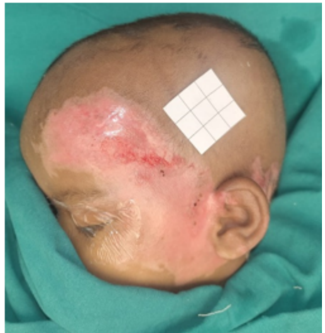
Figure 4: Healed wound