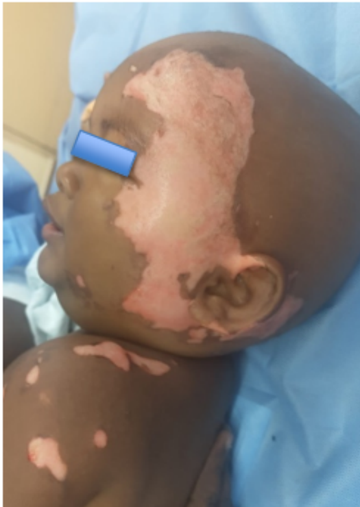
Figure 1: Second degree superficial and deep scald burns at the time of admission

6 that are also implicated in acute inflammation.