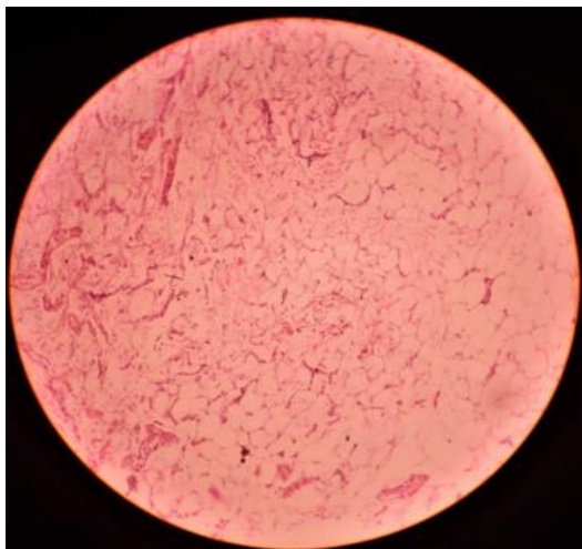
Fig. 1: Shows adipose tissue infraction with fat necrosis