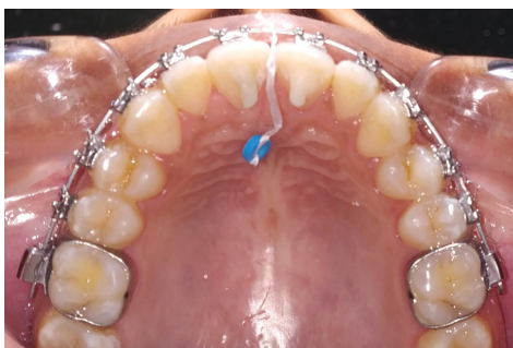
Fig. 4: Composite analysis of cephalometric findings

On extra oral examination patient was diagnosed with a mesoprosopic facial form, potentially incompetent lips and