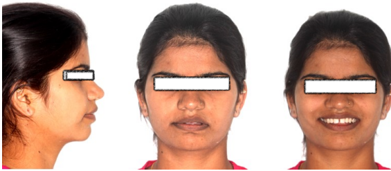
Fig. 1: Pre-treatment extra-oral photographs

history, dental history. Patient gave history of tongue thrusting habit. There were no findings on her fingers.