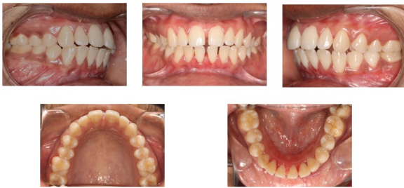
Fig. 2: Pre-treatment intra-oral photographs