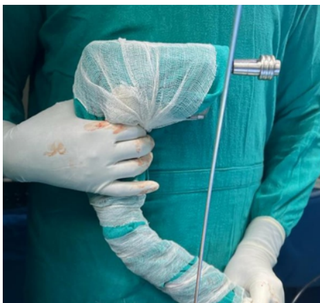
Fig. 2: Drill draped in drapes and secured with an autoclaved cotton bandage.

Steel chuck is corrosion resistant, and with constant exposure to blood and water during surgery, there was a high likelihood that the original iron chuck would corrode and increase the chances of infection. This chuck was equipped with three jaws that securely grasped the drill bit or K wire and opened and closed with a key. The ergonomically built handpiece features a cord for the power supply. We increased the power cable length to seven meters to keep it out of reach of anesthesia equipment and oxygen cylinder. The original drill had a constant speed, so we modified the speed control using a knob to alter the pace depending on whether we used it to drill holes in bone or ream.