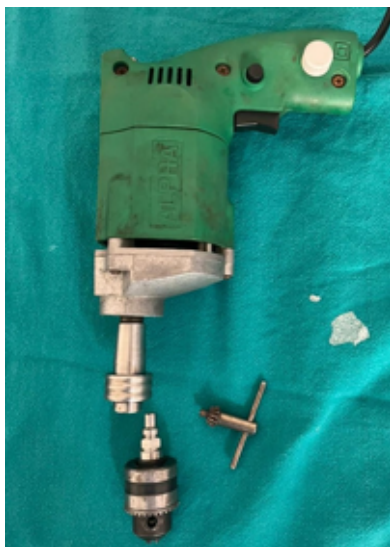
Fig. 1: Drill with detachable chuck, speed controller, and cannulated system