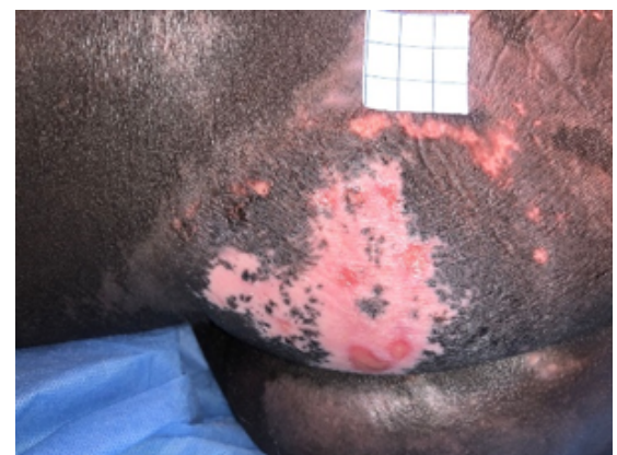
Fig. 5: Healed pressure ulcer