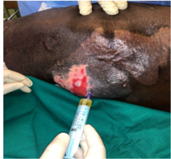
Fig. 3: Application of APRP at ulcer site

The Pressure sore had healed and was entirely covered by dermis after two weeks (Figure 5). There was no indication that the ulcer was getting worse or that it had an infection. The ulcer site was entirely dry and there was no discharge.