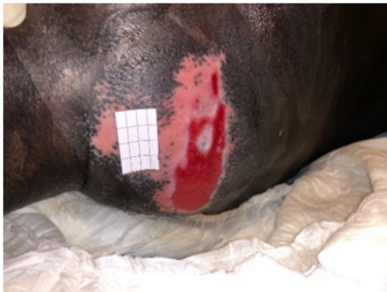
Fig. 1: Grade 2 pressure sore in the patient