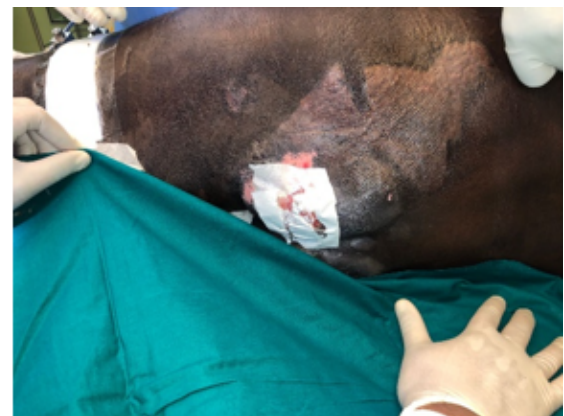
Fig. 4: Collagen dressing over ulcer