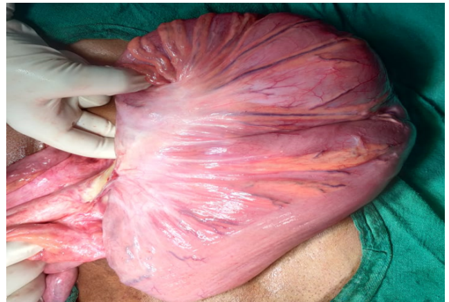
Fig. 3: Intraoperative finding- large colonic distension

stoma formation and future stoma closure.