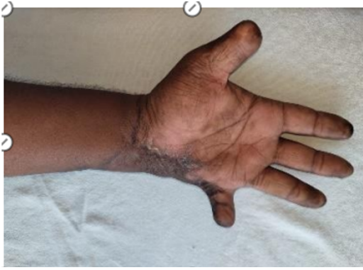
Fig. 1: Patient with flexion contracture of mcp joint of right little finger