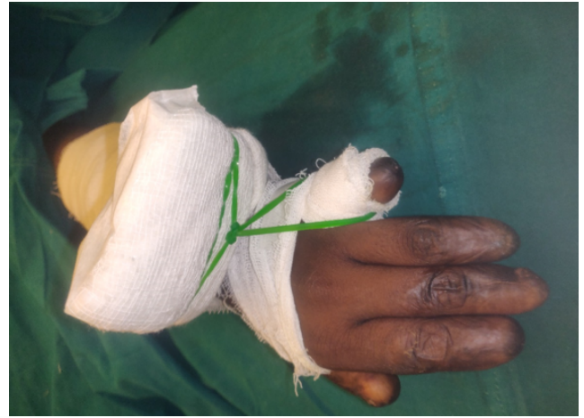
Fig. 4: Dynamic indigenous splint applied to patient