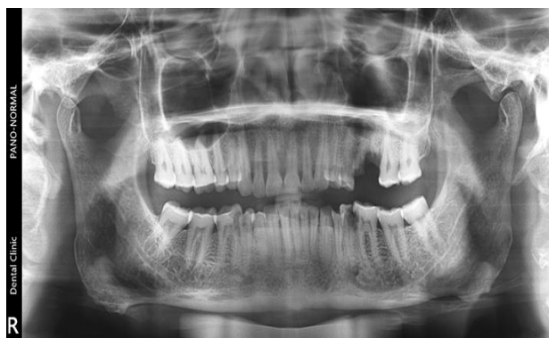
Fig. 4: Orthopantogram of patient