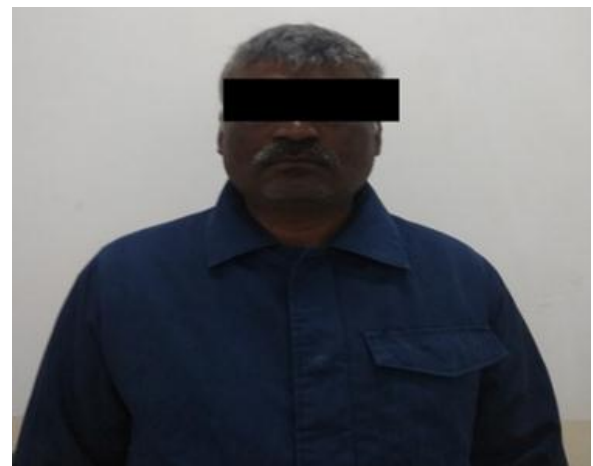
Fig. 1: Extraoral picture of patient

He was advised for the orthopantogram revealed no anomaly of TMJ. There was no erosion of the head of the condyle characteristic of rheumatoid arthritis.