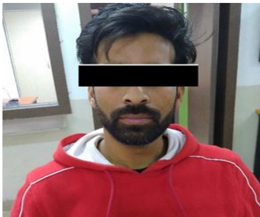
Fig. 3: Extraoral photograph of patient

stumps seen in 26. On careful examination there was clicking on opening the temporomandibular joint (TMJ) and on palpation revealed tenderness in cheek areas. He had a normal mouth opening. He was advised for the orthopantogram revealed anomaly of TMJ. There was no erosion of the head of condyle but the condyle was displaced from its usual glenoid fossa which is indicative of anterior disc displacement.