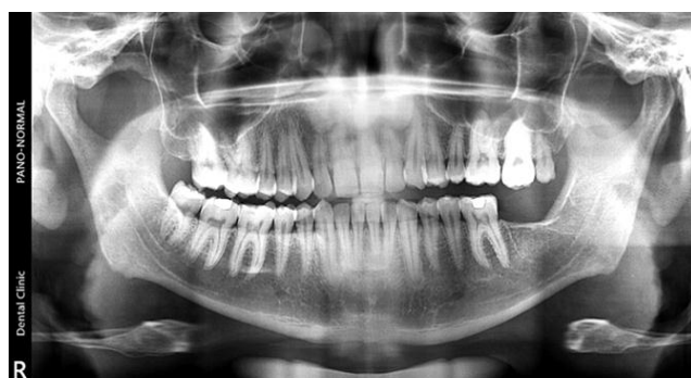
Fig 6: Orthopantogram of patient

He was advised for the orthopantogram revealed no anomaly of TMJ. There was no erosion of the head of the condyle characteristic of myofascial pain dysfunction syndrome.