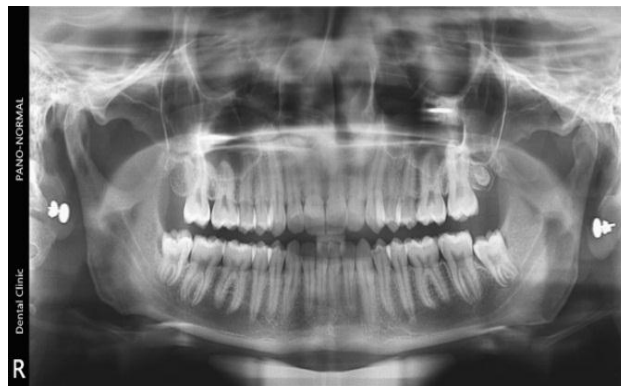
Fig. 8: Orthopantomogram of patient

He was asked to take soft diet perform certain muscle relaxation exercises. He was prescribed with the muscle relaxants including flexon.