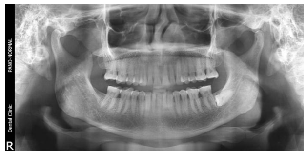
Fig. 2: Orthopantogram of patient