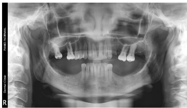
Fig. 7: Orthopantomogram of patient

He has no relevant medical history. Patient brushes once daily with the help of toothpaste and toothbrush. On intraoral examination it was observed he had a normal class I occlusion with loss of teeth. He had no restorations. She had missing 46,47,36,37,24,25,17. On careful examination there was clicking on opening the temporomandibular joint (TMJ) and on palpation revealed tenderness in cheek areas. She had a normal mouth opening. He was advised for the orthopantomogram (Fig. 7) revealed anomaly of TMJ. There was no erosion of the head of condyle on right side but the condyle was displaced from its usual glenoid fossa which is indicative of anterior disc displacement.